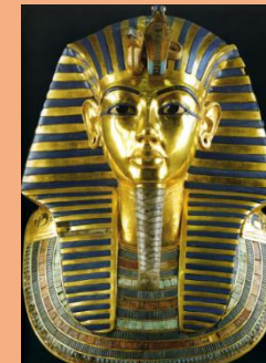
Tutankhamun's death mask.