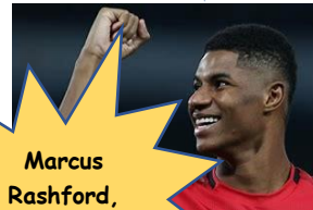
Marcus Rashford, MBE