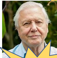
Sir David Attenborough